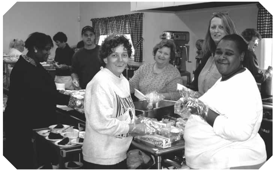
Entering its 5th year, Elkton Community Kitchen Partnership continues to host lunch for everyone every Friday at Elkton Presbyterian Church. Above: Meeting Ground and Settlement House volunteers prepare to serve the meal.

Mission Statement: We, the community of Meeting Ground, are a people of faith, hope and love. Our mission is to help meet basic human needs and to address the root problems that perpetuate the cycle of poverty and homelessness. We bring together homeless and non-homeless persons in a context of shared life and work by providing hospitality, shelter, food and education. We strive to live with compassion, respect, affirmation and advocacy. In the light of the loving community of God's grace, we invite all to participate fully regardless of needs, differences or gifts. At Meeting Ground, in humility, "we all sit at the same table" in ministry one to another, each seeking to discover one's own identity.